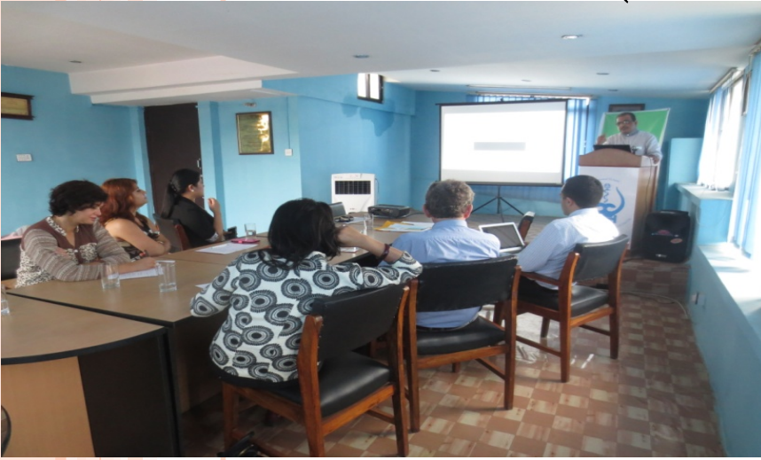
Introductory Lecture & Course curriculum, Paediatric dermatology in Nepal