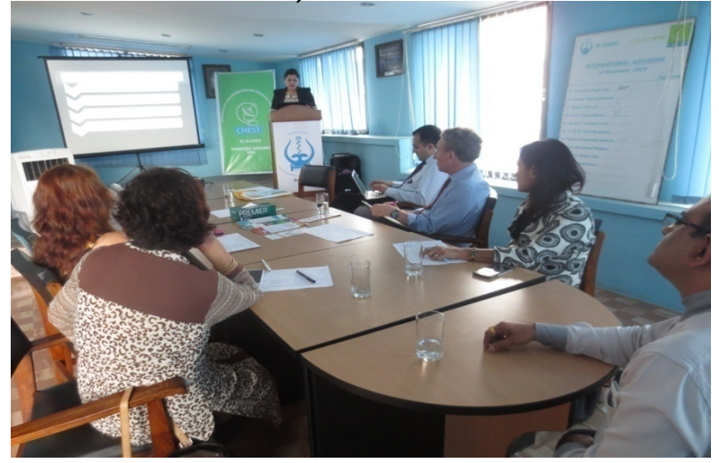
Paediatric dermatology status in DISHARC