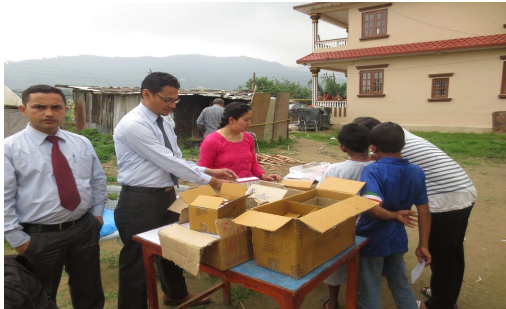
Skin Health Camp at Shelter Nepal, Sitapaila, Kathmandu